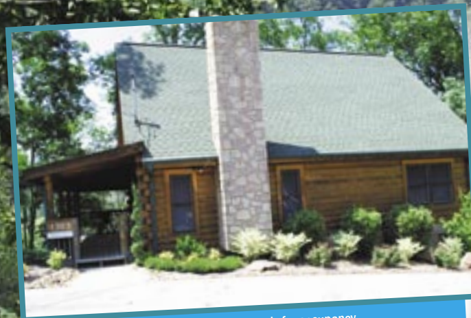
Cabins are of quality construction and ready for occupancy.

Auction to be held at Sevierville Events Center, 202 Gists Creek Road, Sevierville, TN