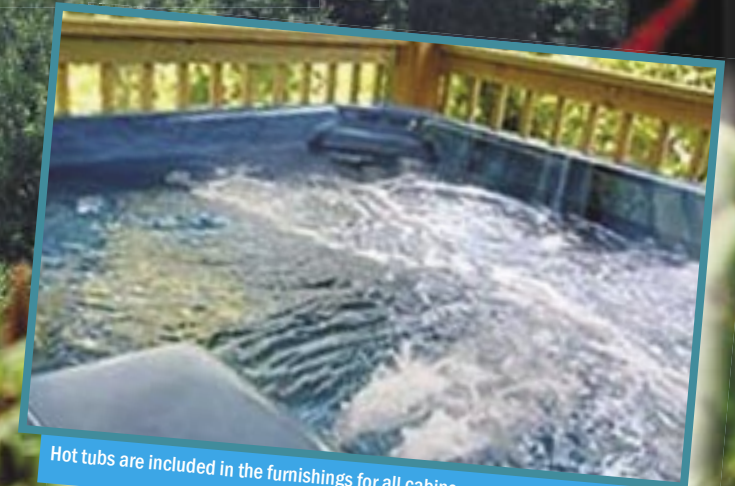
Hot tubs are included in the furnishings for all cabins.