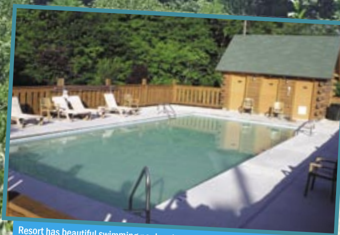
Resort has beautiful swimming pool and active homeowners association.