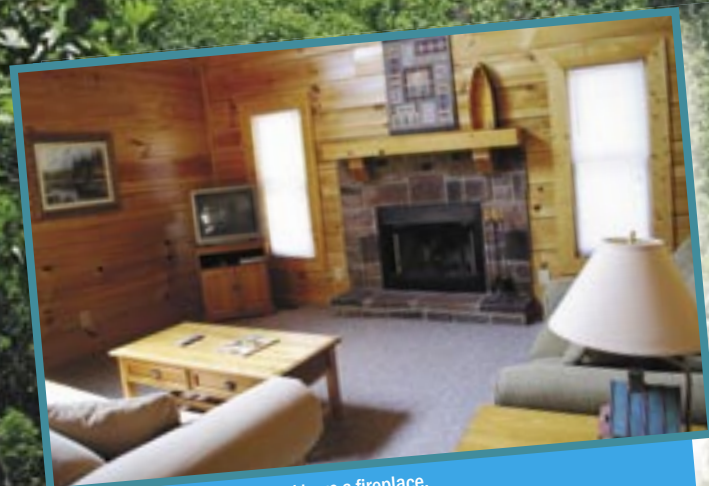
All cabins are furnished and have a fireplace.

3% Broker Participation Available (pre-registration required)